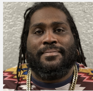
Terrance Thompson Cedar Home